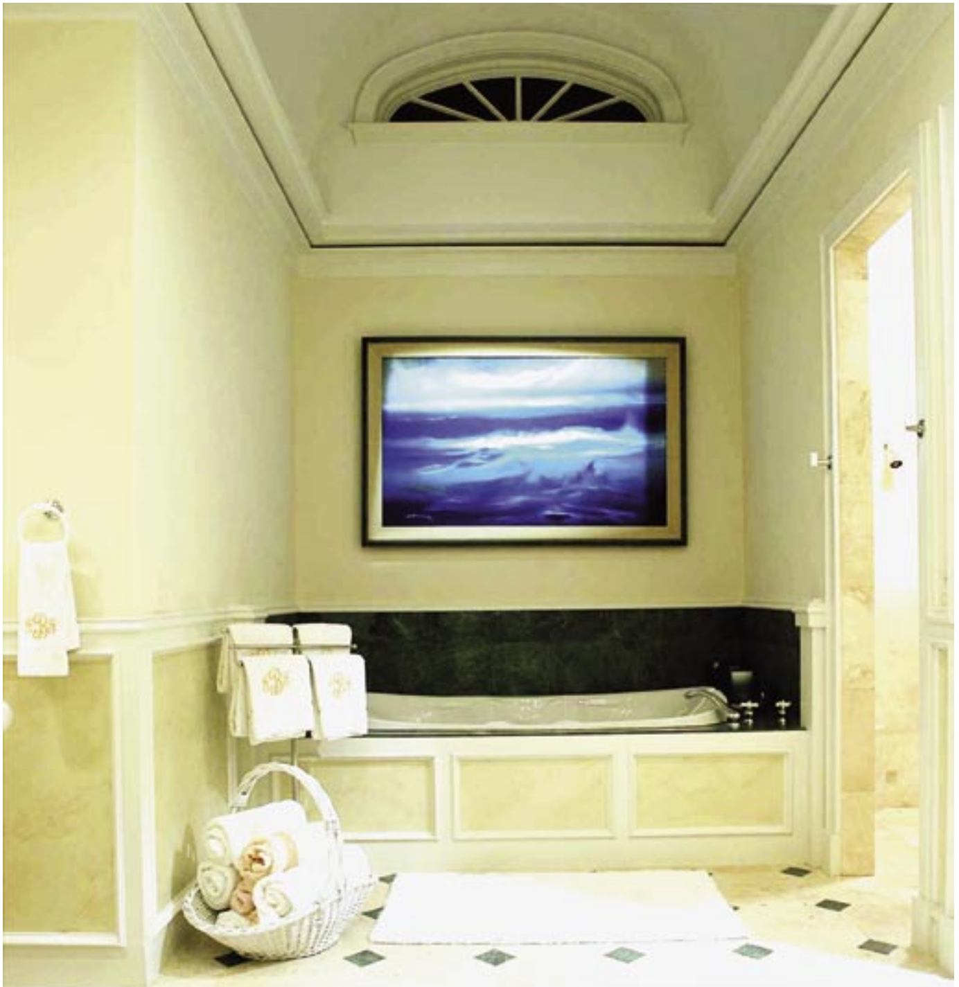
The peaceful garden tub is the perfect woman's escape.