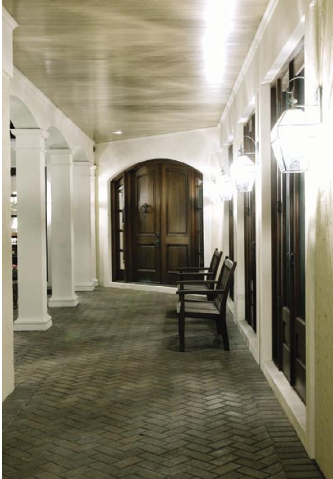
The softly shaped, arched opening theme is carried from the entryway to the colonial columns of the breezeway to the grand entrance.

The architect's vision of this home includes the use of cedar rafter tails to finish the concrete tiled roof and to make use of a popular pitch-break roof truss design. To further